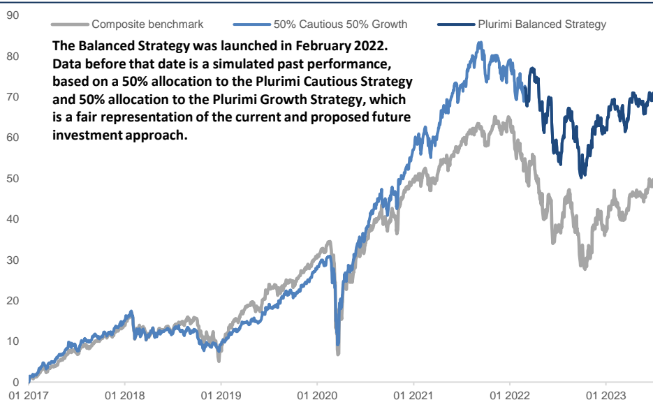
Total return in USD terms. (Jan 2017 - Sep 2023) Gross of fees